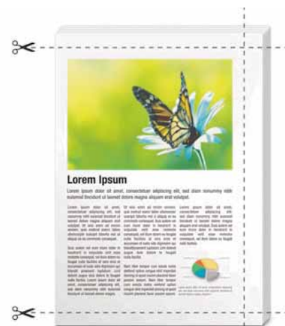
Three/one edge automatic trimming.