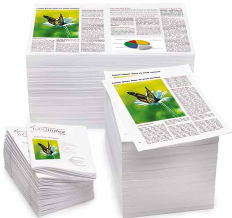
A varied range of finishings for high-value colour documents.

To brighten high-value documents, insert a full colour or pre-printed front and back cover using the double cover interposer. It is the perfect choice to create product catalogues, user manuals and brochures with a lasting impression.