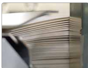
Air-Assisted Paper Feed: air is blown into the paper tray to make the sheets fan out.