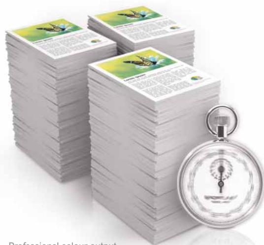
Professional colour output.

Simple, fast and accurate – those are the new job programming keywords. With the Pro™C900 it does not take a skilled operator to perform complex print jobs. Via the EFI driver's compact, tabbed interface, anyone can create professional booklets in a few clicks. Advanced document management and imposition features complete this picture of user-friendliness.